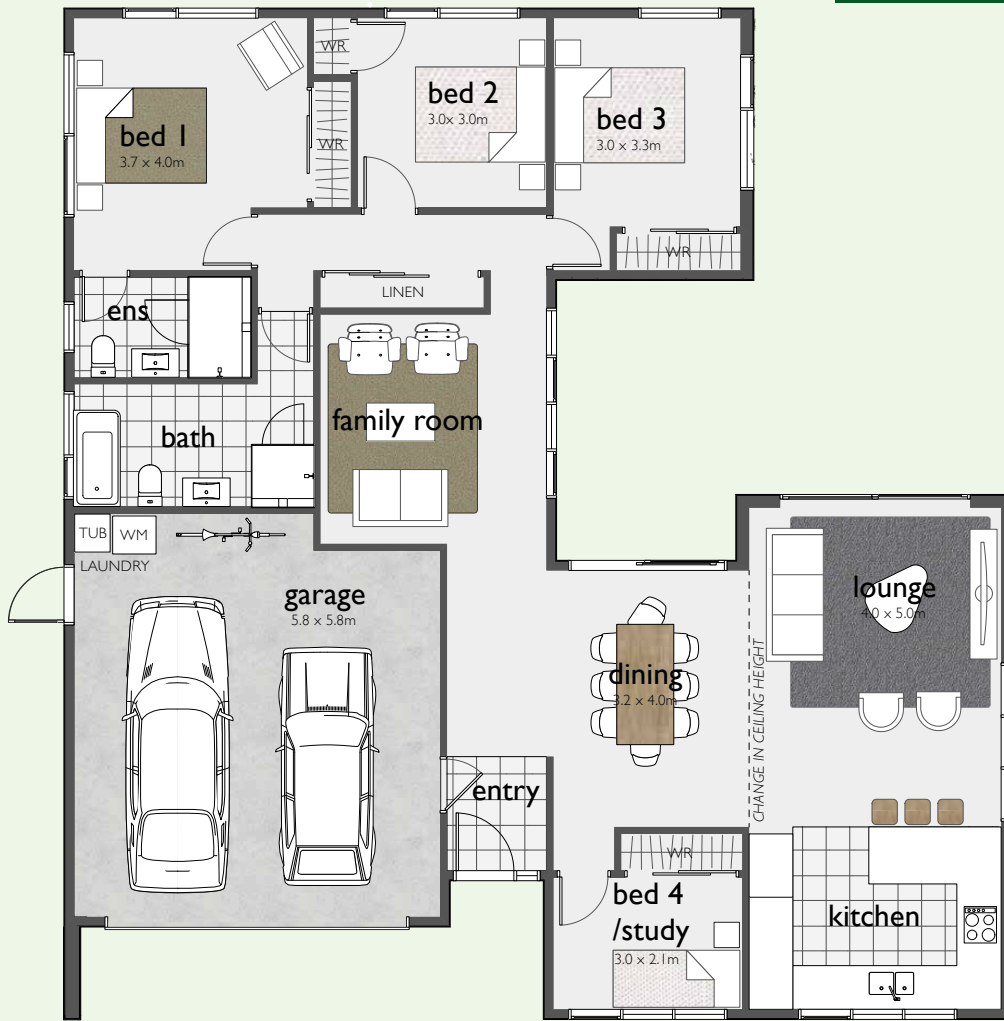
FLOOR PLAN SITE PLAN