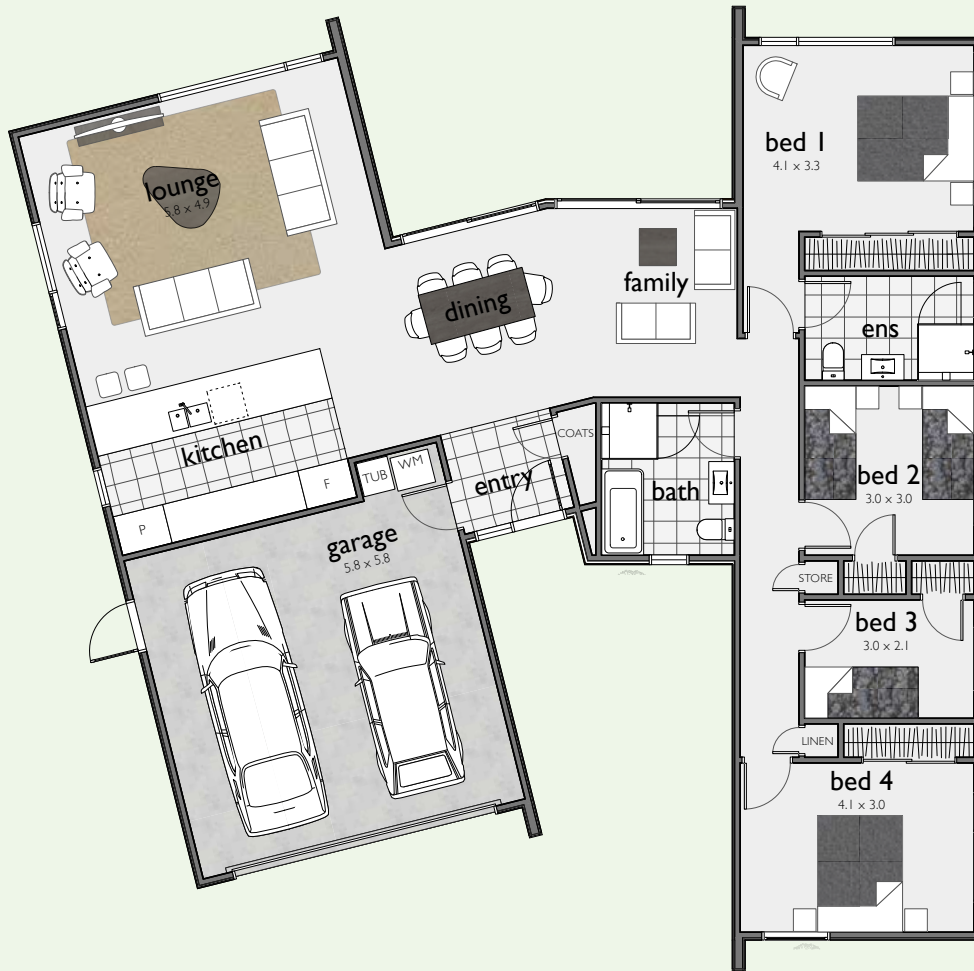
FLOOR PLAN SITE PLAN