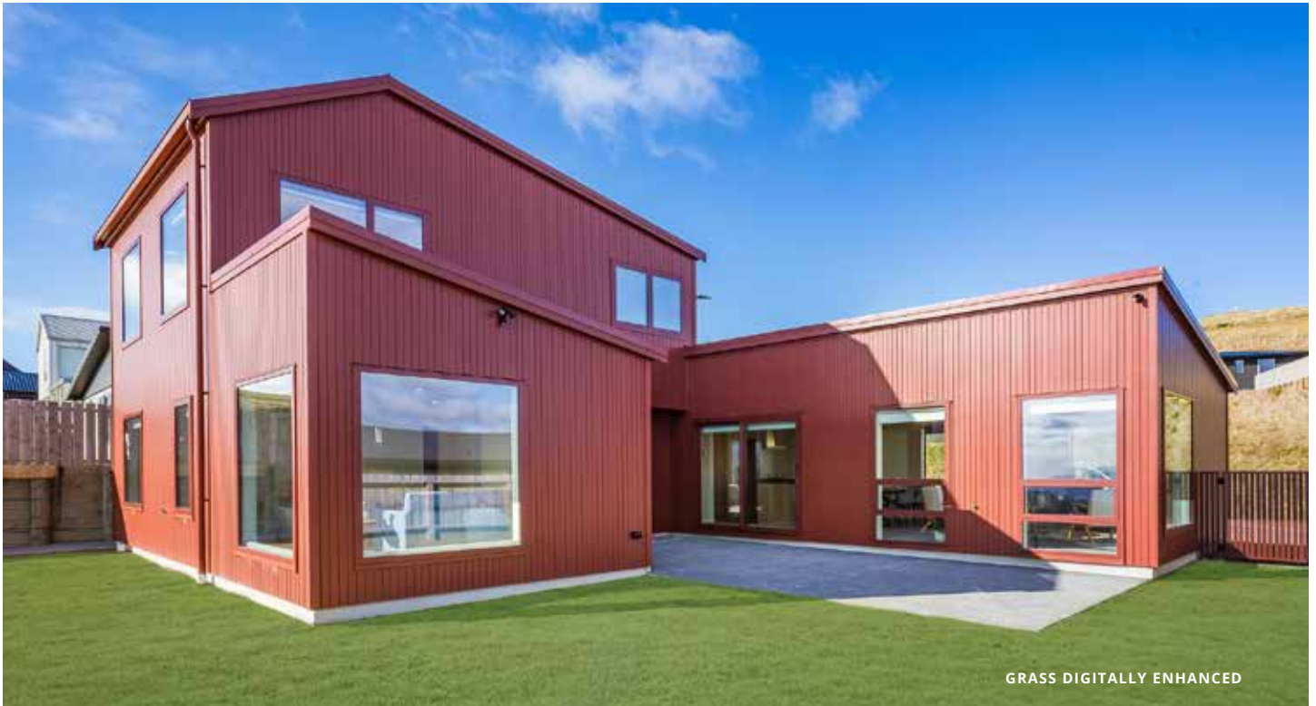
GRASS DIGITALLY ENHANCED