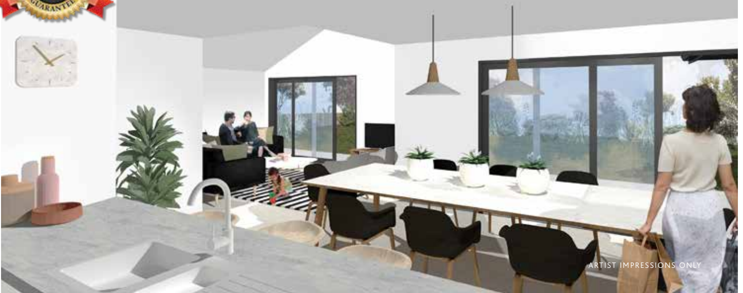
ARTIST IMPRESSIONS ONLY